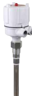
PROCAP I & II HD Heavy Duty Capacitance Probe