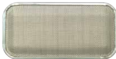
Air Pads Flow Enhancer