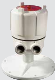
PROCAP I & II FL Flush Mount Capacitance Probe