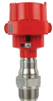
NCR-80 Non-Contact Radar

Measuring Principle: Radar Power: 90 to 253 V AC, 50/60 Hz (regular voltage version) Output: 2-wire 4-20 mA/HART, 4-wire 4-20 mA/HART, Modbus RTU Ambient Temperature: -40°F to 176°F (-40°C to 80°C) Process Temperature: -40°F to 392°F (-40° to 200°C) Mounting: 1-1/2" NPT process connection, DN 80 flange, DN 100 flange with swivel holder, mounting strap, DN 100 adapter flange, DN 80 compression flange depending on model Approvals: CSA / FM Class I, II, III, Div 1, Groups A, B, C, D, E, F, G Pressure: -14.5 to +43 PSI, -1 to +3 bar (-100 to +300 kPa) Range: 393 feet (120 m) Update Rate: < 1 second Resolution: 0.3uA analog, < 1mm (0.039) Accuracy: ± 0.2" (5mm) Enclosure Material: Aluminum or plastic Enclosure Rating: IP66/IP68 (0.2 bar), IP66/IP67, IP66/IP68 (1 bar) Frequency: 79 GHz Beam Angle: 4°