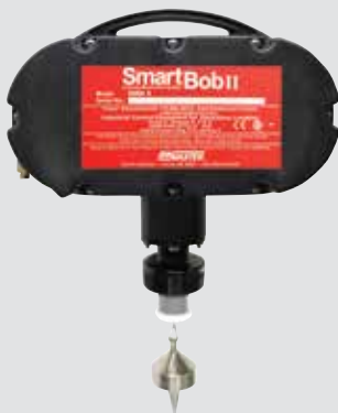
SmartBob II Cable-Based Sensor

Measuring Principle: Cable Power: 115/230 VAC 50/60 Hz Output: RS-485/Modbus/Analog Ambient Temperature: -40°F to +185°F (-40°C to +85°C) Process Temperature: Up to 500°F (260°C) Mounting: 3" - 8" NPT Approvals: Class II, Groups E, F, & G Range: Up to 150 ft. (45 m) Rate: 2 feet per second Resolution: 0.15" (0.4 cm) Accuracy: ± 0.25% of distance measured Enclosure Material: Molded polycarbonate Enclosure Rating: NEMA 4X, 5, 9 & 12 (IP65)