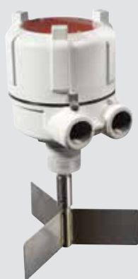
BMRX Standard Rotary