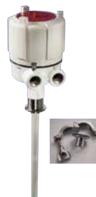
PROCAP I & II 3-A