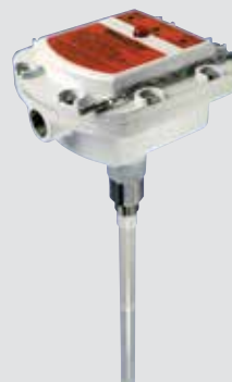
PRO AUTO-CAL Auto-Calibrating Capacitance Probe