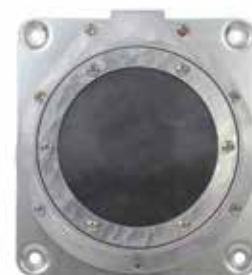
BM45 Diaphragm Switch

Power: 15 Amps @125, 250 or 480 VAC, 1/8 HP @ 125 VAC, 1/4 HP @ 250 VAC, 1/2 Amp @ 125 VDC, 1/4 Amp @ 250 VDC