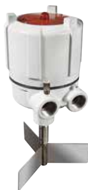
MAXIMA+ Fail-Safe Rotary

Relay/Switch: SPDT 10 Amp, 250 VAC (solid state relays optional)