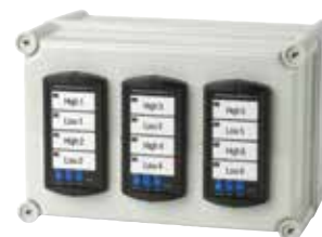
Annunciator Point Level Alarm Panel