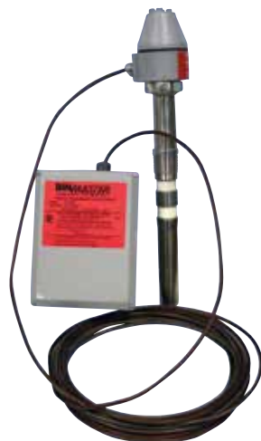
PRO HTRC-20 Remote Capacitance Probe

Process Temperature: Up to 1112°F (600°C)