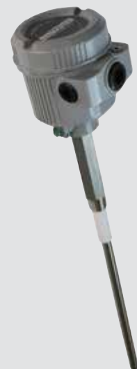
DD-3000 Dust Alert

Approvals: Ordinary/General Purpose Only, CE Approved (CSA/UL Approval Pending)