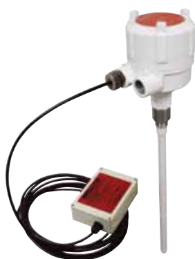
PRO REMOTE Remote Capacitance Probe