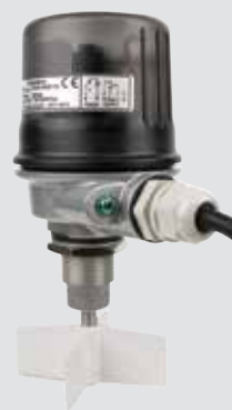
Mini Rotary Compact Rotary