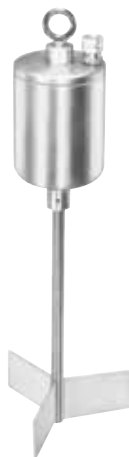
BM-T Hanging Tilt Switch