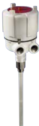
PROCAP I & II