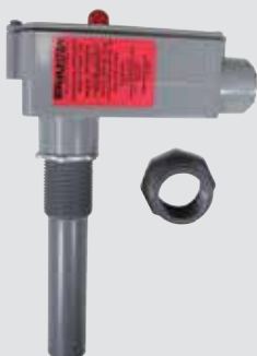
Compact PRO Mini Capacitance Probe

LED: Indicates material presence or absence