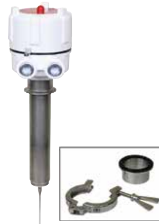
VR-31 Sanitary Vibrating Rod

Time Delay: 1 second from stop of vibration, 2 to 5 seconds for start of vibration