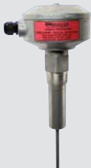
CVR-600 Compact Vibrating Rod