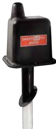
SmartBob TS1 Cable-Based Sensor

Measuring Principle: Cable Power: 115/230 VAC 50/60 Hz Output: RS-485/Modbus/Analog Ambient Temperature: -20°F to +140°F (-29°C to +60°C) Process Temperature: Up to 140°F (60°C) Mounting: 3" - 6" NPT or bolt on Range: Up to 60 ft. (18 m) Rate: 1 foot per second Resolution: 0.15" (0.4 cm) Accuracy: ± 0.25% of distance measured Enclosure Material: Molded polycarbonate Enclosure Rating: NEMA 4X, 5, 12 (IP65)