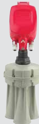
3DLevelScanner Non-Contact Sensor

Measuring Principle: Acoustic Power: 20 - 32 VDC Output: 4-wire 4-20mA/HART/RS-485/Modbus Ambient Temperature: -40°F to 185°F (-40°C to 85°C) Process Temperature: -40°F to 185°F (-40°C to 85°C) Mounting: 0°, 5°, 10°, 20°, and 30° mounting plates and assemblies Approvals: ATEX II 1/2D, 2D, Ex ibD/iaD 20/21 T110°C, ATEX II 2G Ex ia/ib IIB T4, FM Intrinsically Safe Class I, II, Division I, Groups C, D, E, F, G Pressure: -0.2 - 1bar (-2.9 to 14.5 psi) Range: 200 ft. (61 m) Enclosure Material: Die cast aluminum, powder coated Enclosure Rating: IP67 Frequency: 3 KHz to 10 KHz