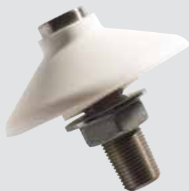
Airbrator Aeration & Vibration

Approvals: FDA 21CFR177.2600 (a – e, g, h)