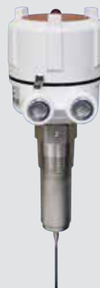
VR-21 Standard Vibrating Rod

Time Delay: 1 second from stop of vibration, 2 to 5 seconds for start of vibration